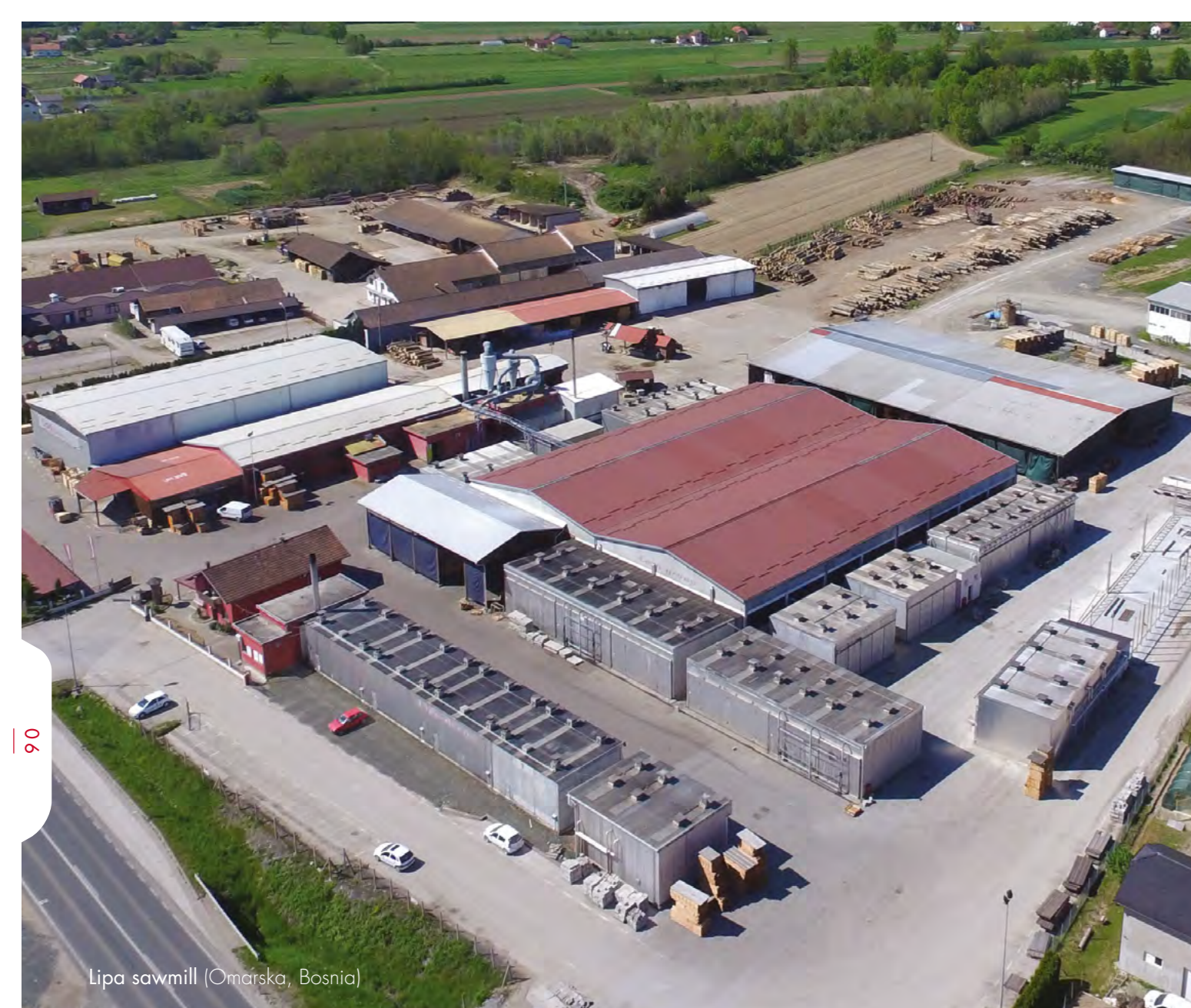
Lipa sawmill (Omarska, Bosnia)